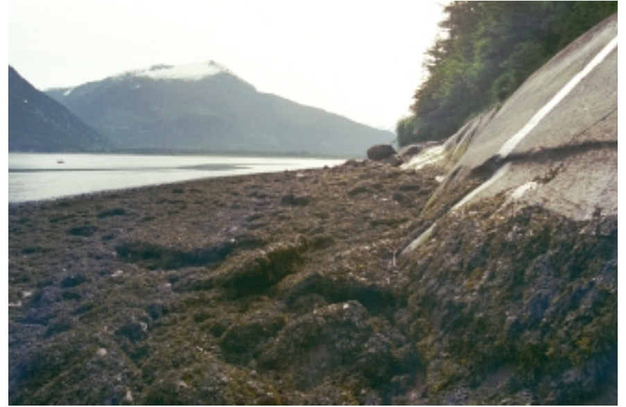
T13- FACING EAST