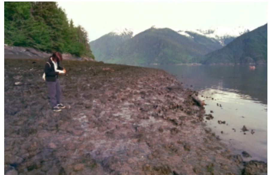
T5 - FACING WEST