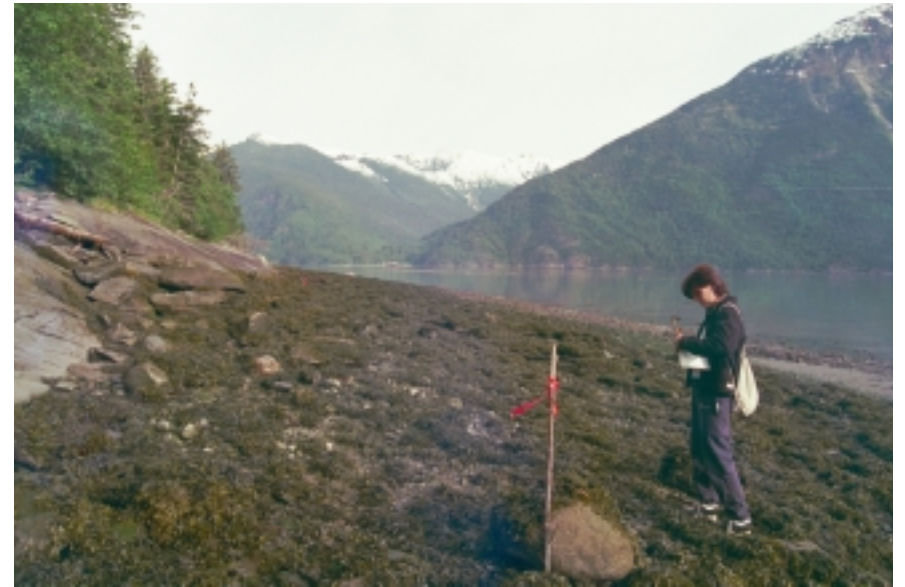
T1- FACING EAST