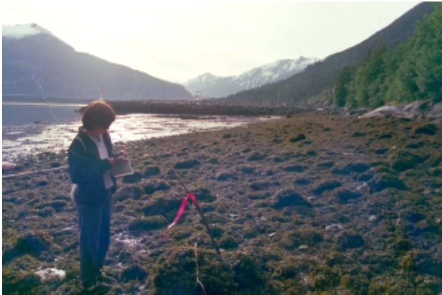
T1- FACING EAST