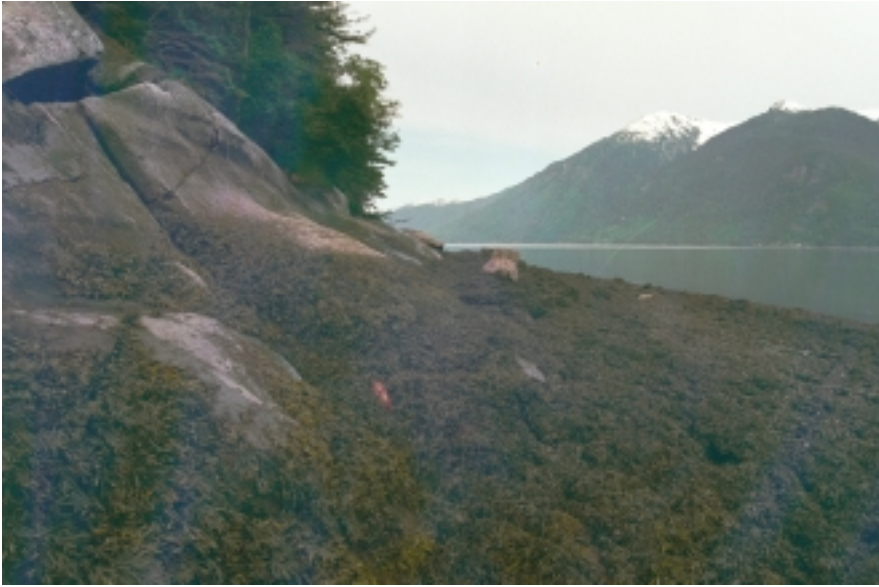
T13- FACING WEST